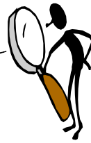
FIGURE OUT IF THE REVIEW IS FROM A MAGAZINE OR A SCHOLARLY JOURNAL & COMPLETE THAT HALF. THEN, COMPLETE THESE THREE LINES FOR THE DATABASE.